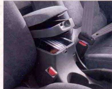
The center console includes a two-level storage compartment, dual beverage holders and a padded armrest.