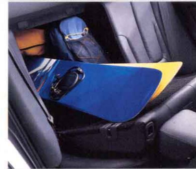
The GT's 60/40 split fold-down rear seatback helps you handle plus-size cargo.