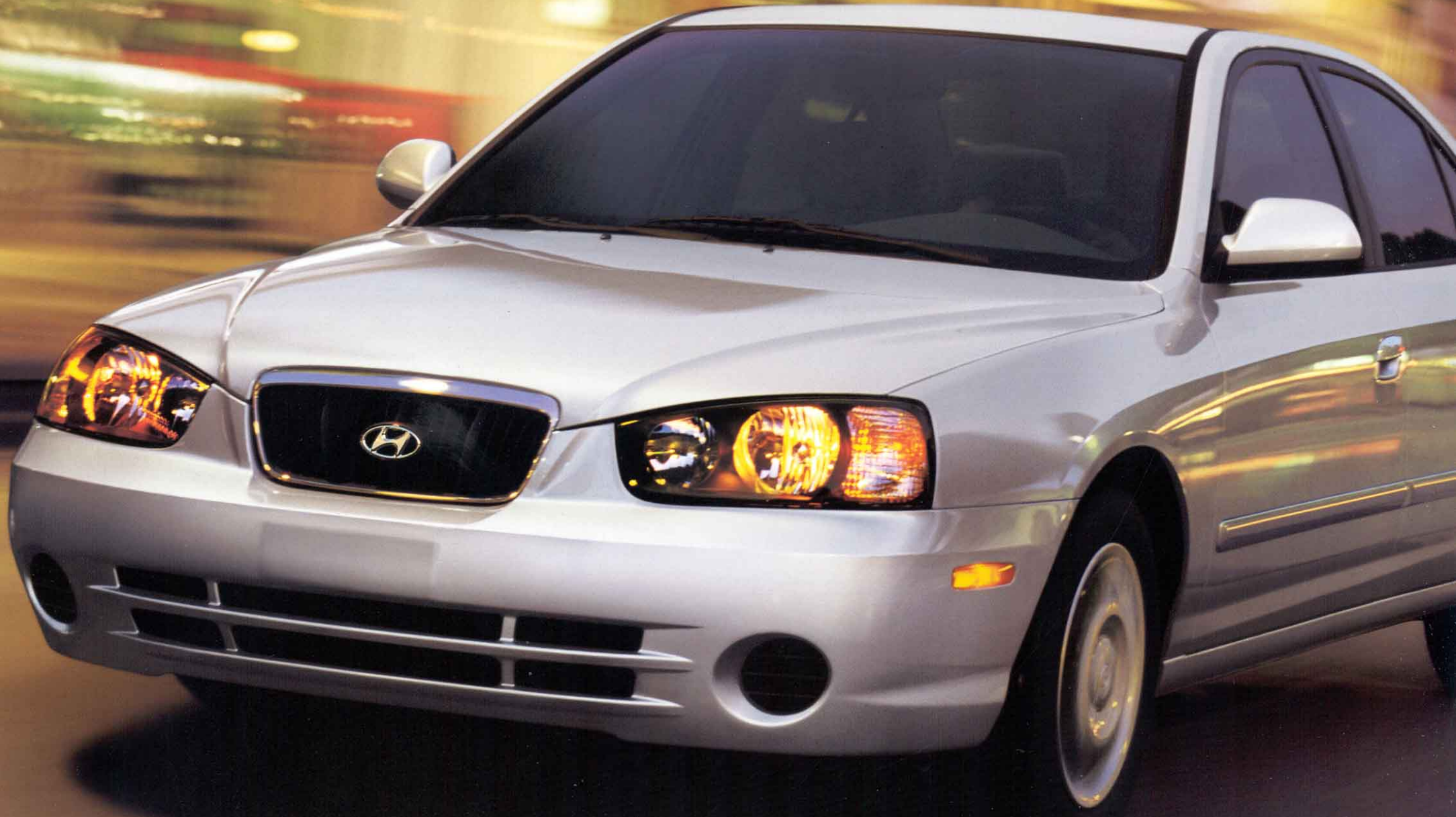
Elantra GLS in Pewter