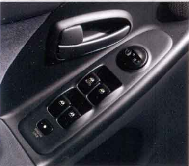
The handy Auto-down feature fully lowers the driver's window with one touch.