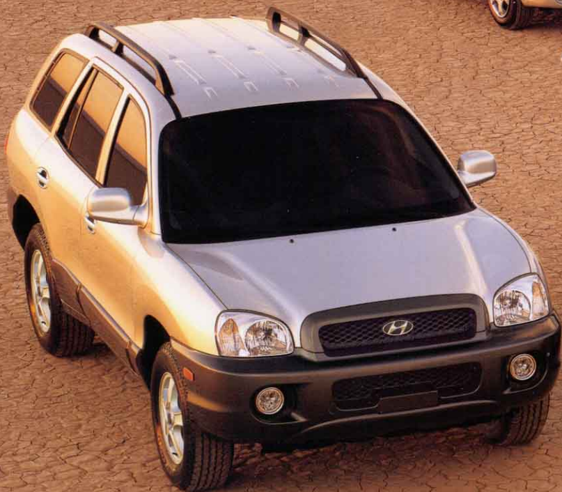
Santa Fe LX