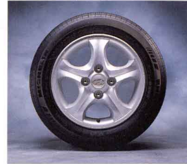
Standard 5-spoke, 15-inch alloy wheels give the GT a handsome finishing touch.

Presenting the 2002 Elantra GT, a strikingly handsome sedan that offers performance, versatility and value, all with a distinctly European flair. Besides a dashing appearance, the GT's 5-door silhouette offers a new world of utility. The low lift-over cargo access lets you load and maneuver bulky items easily. And thanks to its generous cargo area and a 60/40 split fold-down rear seatback, the Elantra GT offers carrying capacity beyond that of a conventional sedan (a nice feature to have when toting skis, surfboards or even a week's worth of groceries). The GT is also distinguished by 5-spoke aluminum alloy wheels, unique grille and headlights, an aerodynamic front air dam with integrated fog lights, rear window wiper/washer, sporty black bodyside moldings, and even a couple of hot new colors. With so many standard features, the Elantra GT is obviously a very smart, sensible buy. And so great looking, no one ever has to know.