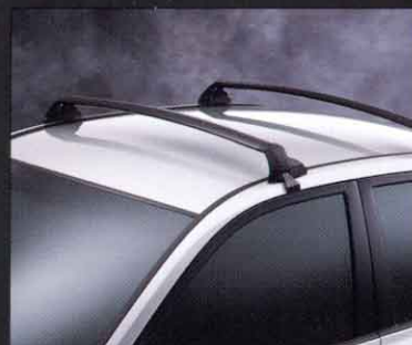
The available roof rack can handle the gear your active lifestyle demands.