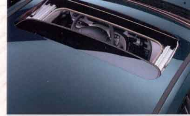
The available 2-way power glass moonroof tilts up or slides open.

If you've never experienced an Elantra GLS, you'll be delighted by its array of luxurious standard amenities, including air conditioning, power windows, door locks and heated mirrors, tilt steering column, AM/FM stereo cassette, 60/40 split fold-down rear seatback, and a quartz digital clock. Elantra GLS also comes with plenty of standard features designed to make your driving more enjoyable. There's a handy center console with two-level storage compartment and armrest, dual beverage holders, theater-dimming entry lighting, remote hood, fuel filler door and trunk releases, and a multi-adjustable driver's seat with lumbar support. In fact, about the only thing the Elantra GLS doesn't give you is a long list of expensive options. For that, you'll have to try the competition.