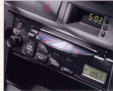
An AM/FM stereo CD player with 6 speakers is available on the Elantra GLS.