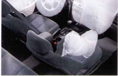
Dual front airbags and front side airbags are best-in-class standard features.