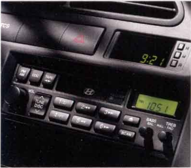
An AM/FM stereo cassette with 4 speakers is standard on the Elantra GLS.