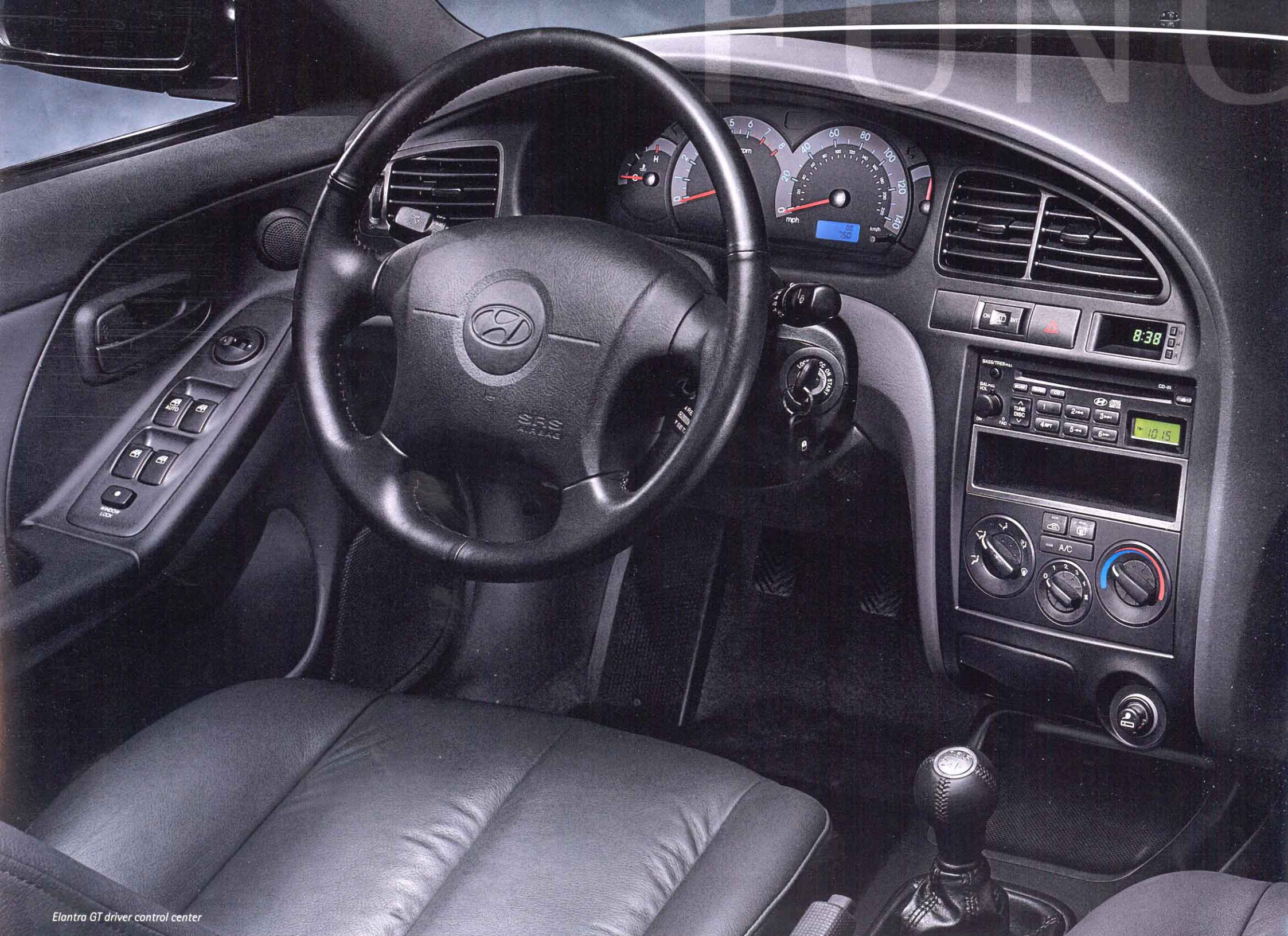
Elantra GT driver control center