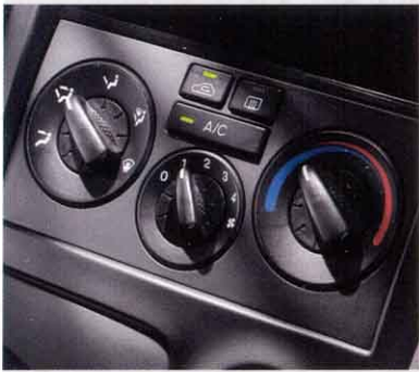
Standard CFC-free air conditioning helps you stay cool and comfortable.

The Elantra GLS cabin is based on the idea that the place where you spend 100% of your driving time should make you feel 100% comfortable. The result is a driving environment that's thoughtfully designed and utterly accommodating. You'll find examples of forward thinking throughout the GLS cabin. For instance, the anatomically contoured, multi-adjustable front bucket seats are formed from a single piece of high-density foam, which retains its shape to provide comfort and support even on long drives. Vital switches and controls are ergonomically positioned for easy access. Gauges are readable at a glance and placed within the driver's natural line of sight. There's a versatile 60/40 split fold-down rear seatback that helps you handle plus-size cargo, as well as an abundance of map pockets and storage compartments to keep your important items at hand. You'll find this kind of thoughtful design throughout the Elantra GLS. After all, any car which so ably handles the road should do no less for its driver.