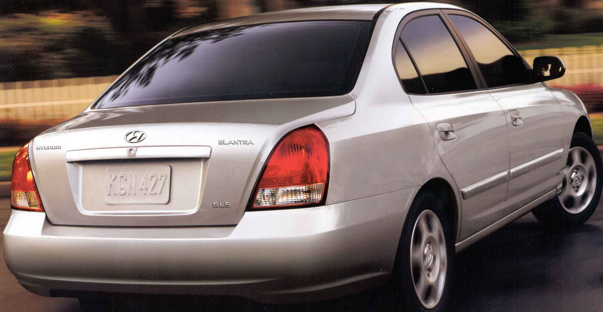
Elantra GLS in Pewter