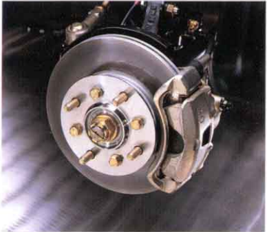
An Anti-lock Braking System (ABS) 2 with a Traction Control System (TCS) 3 is available on the Elantra GLS and GT.