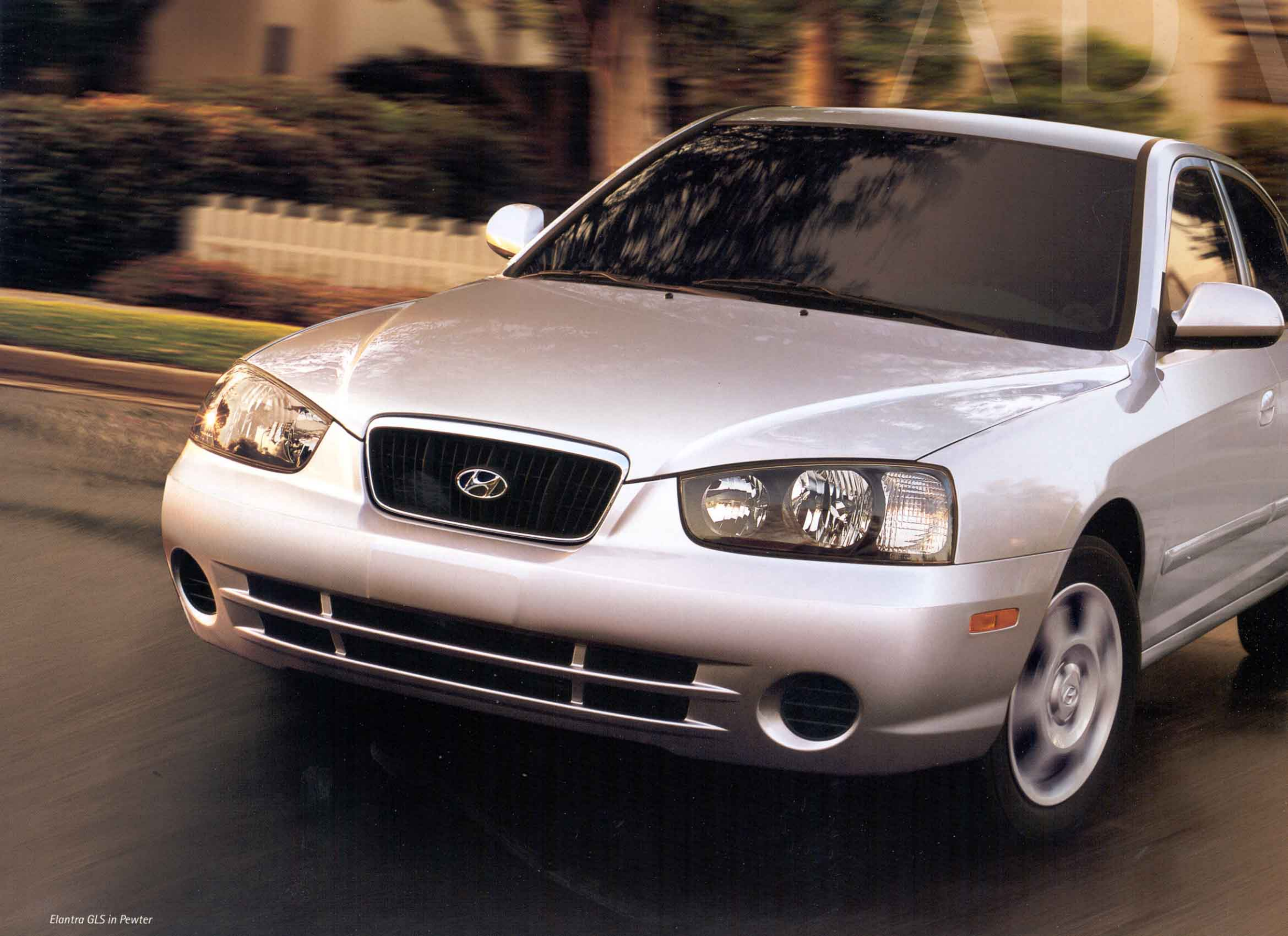
Elantra GLS in Pewter