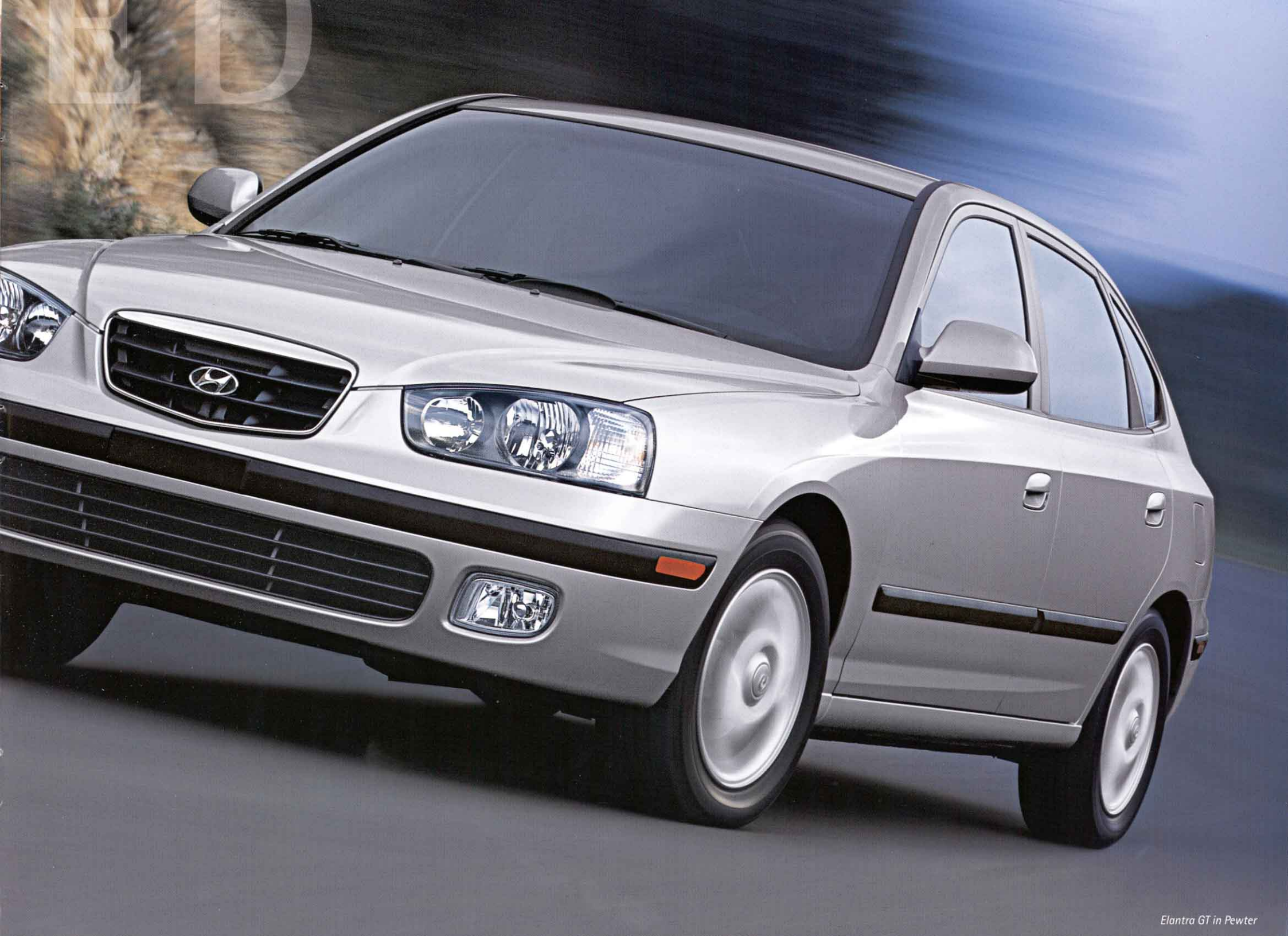
Elantra GT in Pewter