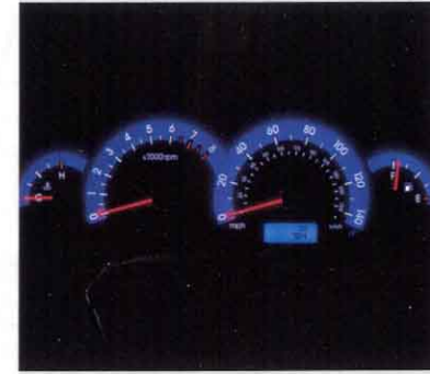
Elantra GT's trip computer shows miles traveled, elapsed time, and miles to empty.

Given the Elantra GT's ability to multitask, it should come as no surprise that its roomy, comfortable cabin is also a great place to conduct the business of driving. Standard amenities include a leather-trimmed interior, leather-wrapped steering wheel and shift knob, air conditioning, power windows, door locks and heated mirrors – and the standard equipment doesn't stop there. Also on board are an AM/FM stereo and CD player with six speakers, a remote keyless entry system with alarm, and a steering wheel-mounted cruise control you can operate while keeping your attention on the road. The Elantra GT cabin combines all this comfort with driver-pleasing functionality. There's an anatomically contoured, reclining driver's seat with adjustable lumbar support, a high-contrast, purple-illuminated instrument cluster and a multi-function electronic trip computer that displays current and elapsed time, distance traveled and miles to empty. And of course, the assorted map pockets, storage compartments and beverage holders that make driving easier and more fun. Which is, after all, the whole idea.