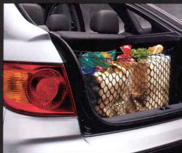
A custom-fitting trunk net helps keep your cargo in place.

Your Hyundai dealer can show you a full line of genuine Hyundai accessories designed to make driving your Elantra even more enjoyable. To keep your Hyundai looking and running like new, always use genuine Hyundai parts and accessories, which meet our own strict standards for quality and durability.