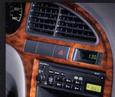
Available woodgrain trim adds an upscale touch to the interior.