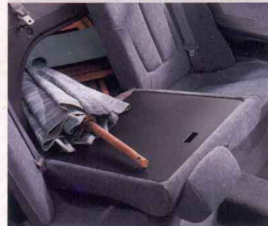
To better handle bulky items, the Elantra GLS comes with a 60/40 split fold-down rear seatback.