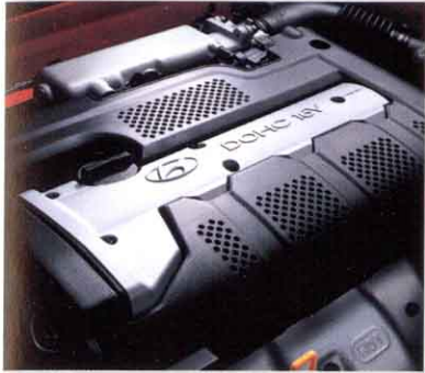
The Elantra GT's 2.0-liter DOHC engine produces 140-horsepower with exceptional smoothness and quietness.

1 Available as part of a specific option package. See dealer regarding availability. 2 Available as part of a specific option package. See dealer regarding availability. The Traction Control System (TCS) is meant to enhance conscientious driving habits, and is not a substitute for proper driving procedures.