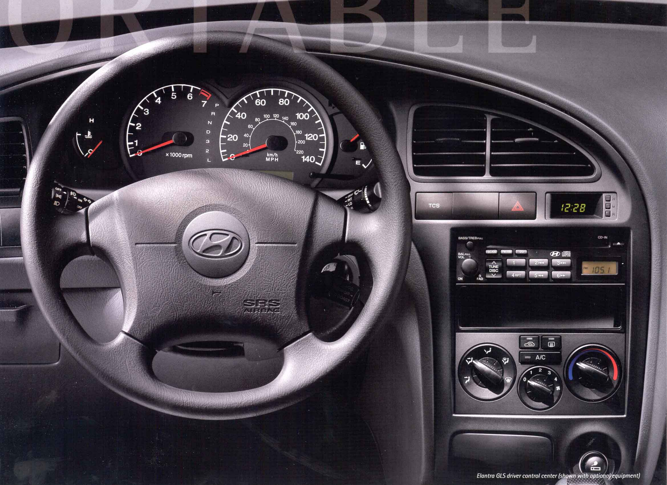
Elantra GLS driver control center (shown with optional/equipment)