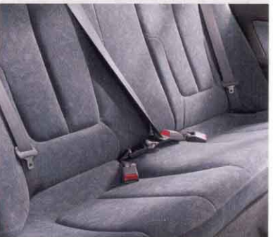
Elantra GLS and GT provide 3-point seatbelts at all seating positions.