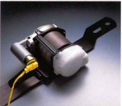
The 3-point front seatbelt pretensioners lock in the event of a moderate to severe frontal impact.