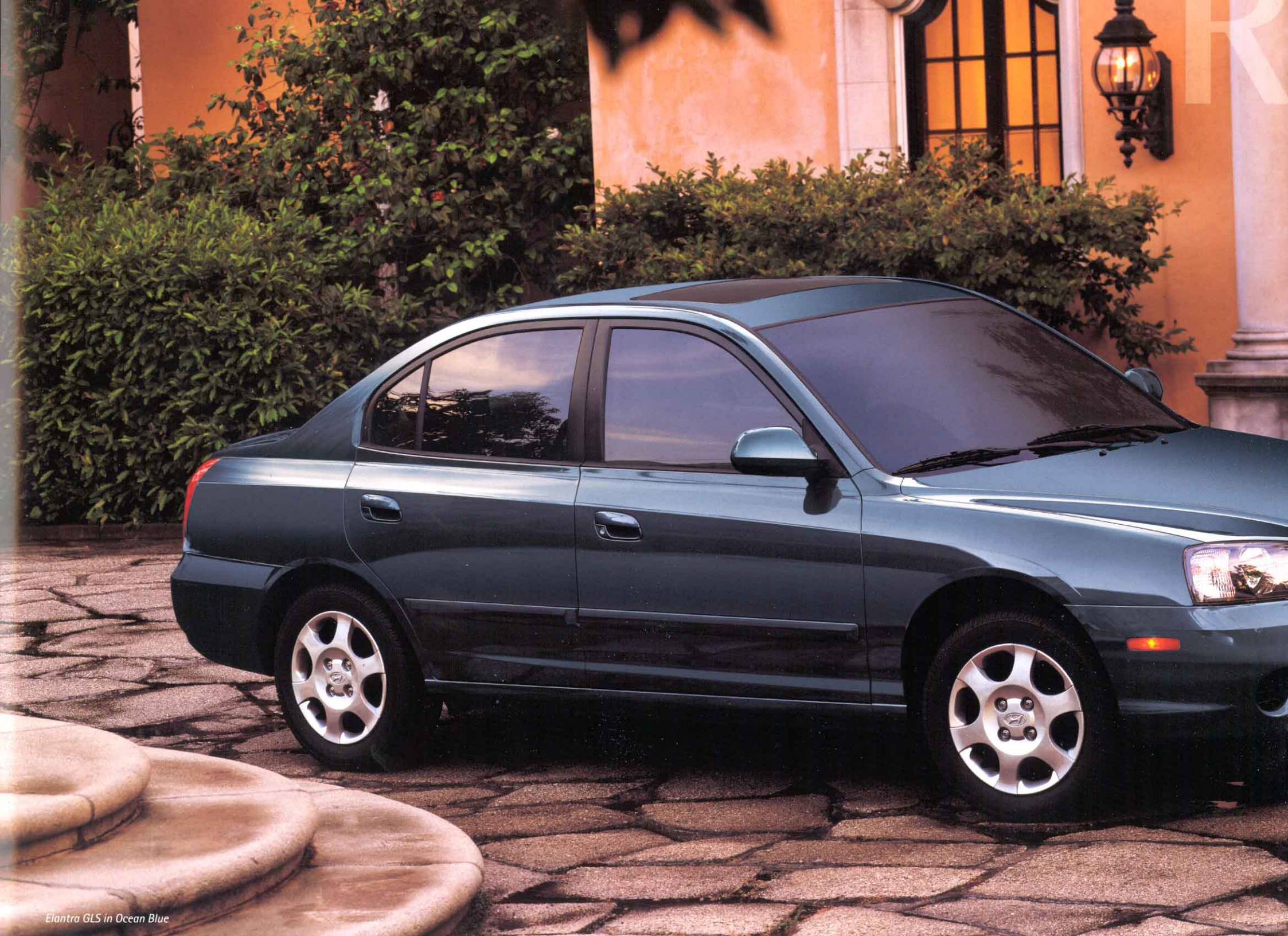
Elantra GLS in Ocean Blue