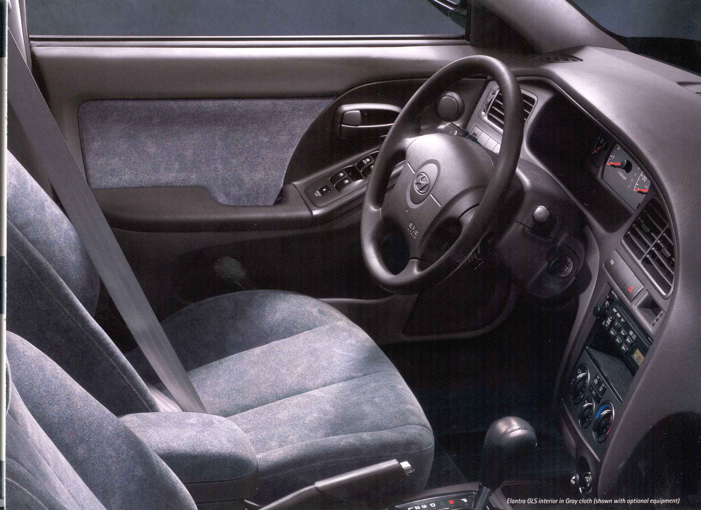
Elantra GLS interior in Gray cloth (shown with optional equipment)