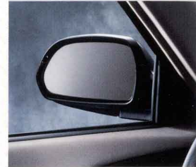
Heated dual power mirrors are standard on the Elantra GLS.