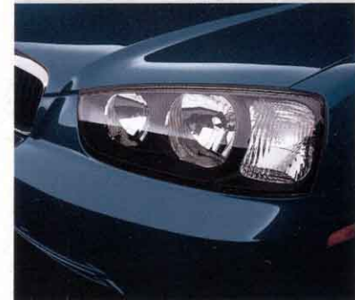
Aerodynamic clear-lens halogen headlights provide bright, even illumination.