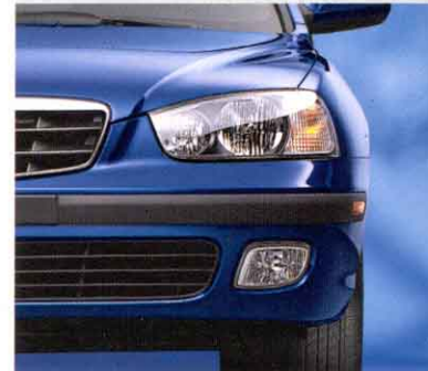
The Elantra GT's front air dam houses integrated fog lights to aid driver visibility.