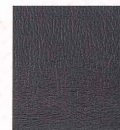
Dark Gray Leather