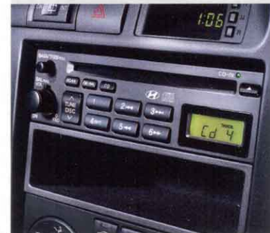
An AM/FM stereo CD player with 6 speakers is one of the GT's many cool standard features.