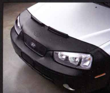
Protect your Elantra's finish with a durable, front nose mask.