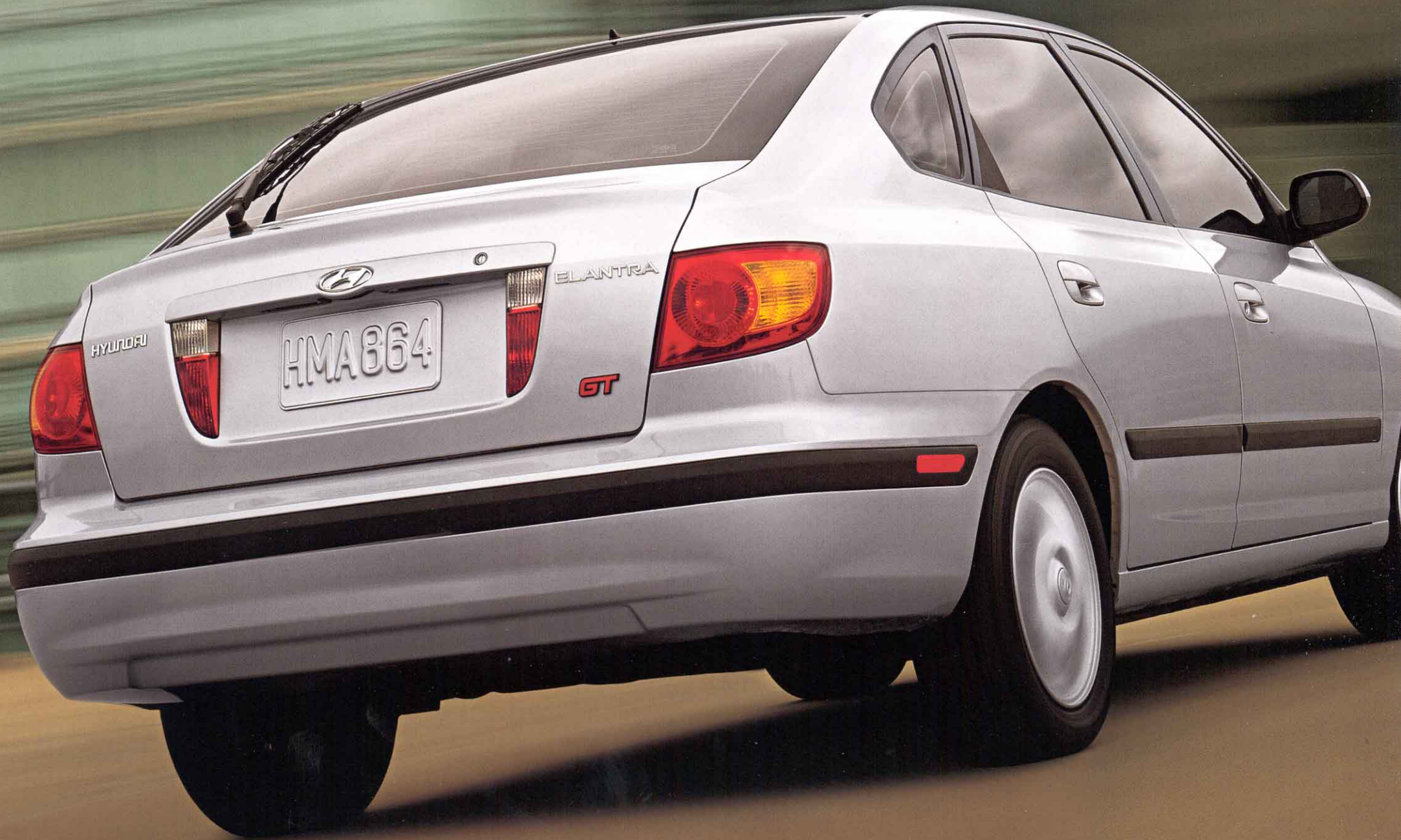
Elantra GT in Pewter